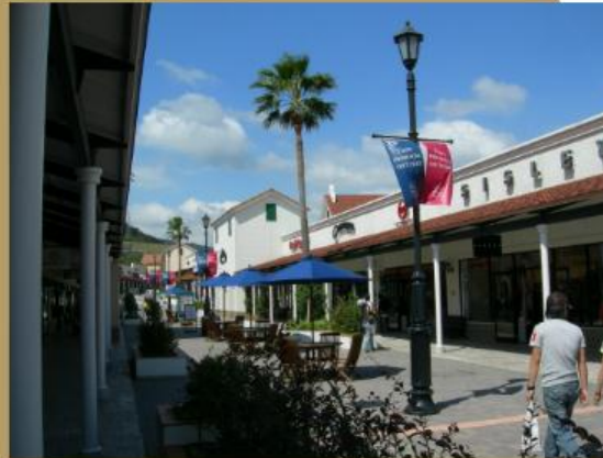
Tosu Premium Outlets