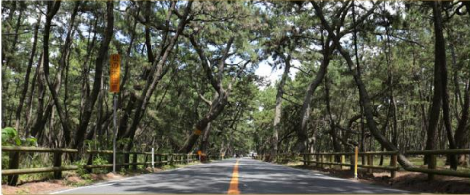
Niji no Mastubara Forest