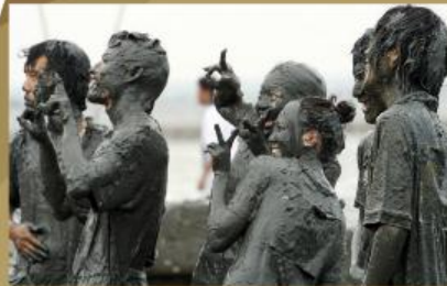
Ariake Mudflat Experience