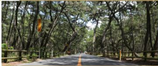
Niji no Mastubara Forest