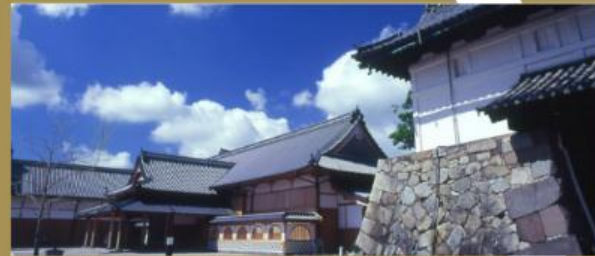
Saga Castle History Museum