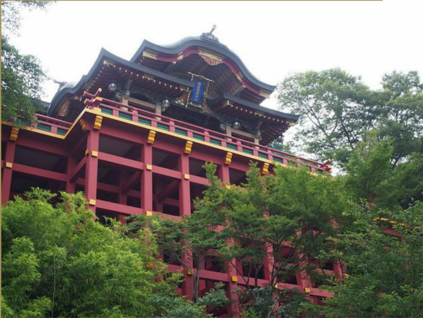
Yuutoku Inari Shrine