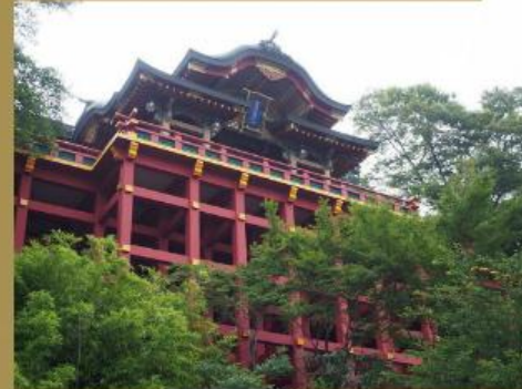
Yuutoku Inari Shrine