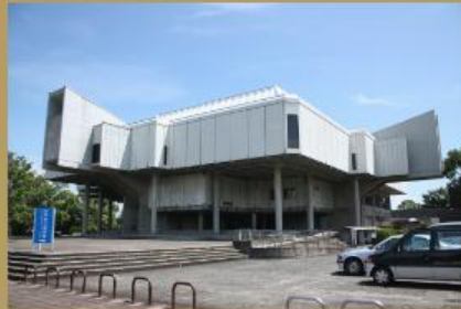
Saga Prefectural Museum